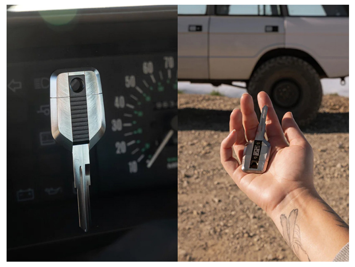
Machined from Perpetua Stainless Steel§ within Swiss-watch standards, Formawerx Keypieces are precise in their form, as well as being balanced in weight, and nearly indestructible. Handy to know while you're pushing your Range Rover's off-road capability to its limit. What's more, this key is built to OEM Land Rover factory specifications and can be duplicated to your own key through Formawerx's in-house service.

The best part? These keys are now available from the CD Shop, so get yours today!