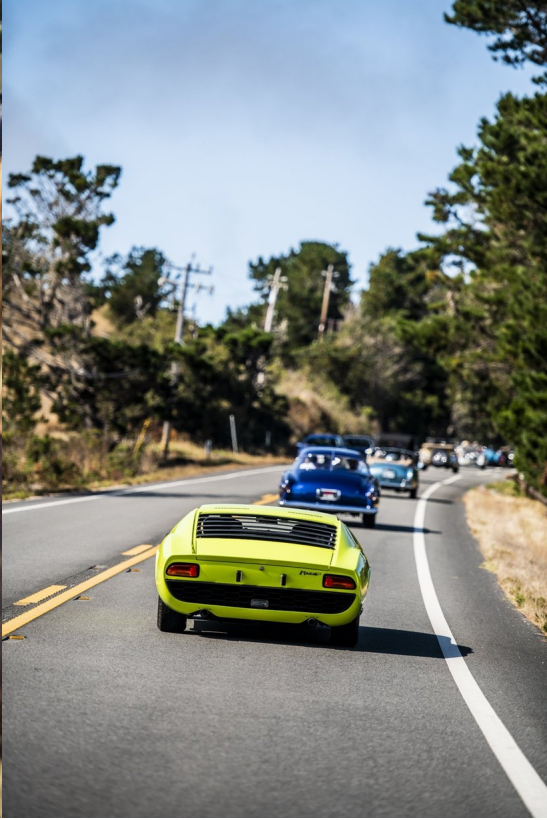
Tracing the legendary 17-Mile-Drive and Highway 1, following the Pacific coastline towards Big Sur, before looping back to cross the Rolex finish gantry in Pebble Beach, the Tour d'Elegance plays a crucial role in the Concours. As many of you know, if two cars tie for 'Best in Class', the one which has completed the Tour will be selected as a finalist with a chance of securing that all-important 'Best in Show' trophy.