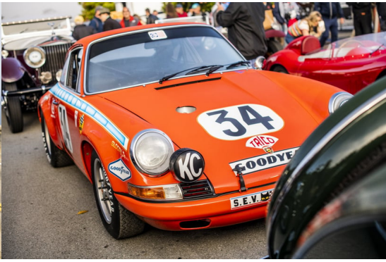
Before the custodians of some of the world's finest metal can (try to) relax as their prized possessions are scrutinised on the perfectly manicured greens of the Pebble Beach Golf Club, they must fire up their engines and warm their tyres on the picture-perfect roads of coastal California.