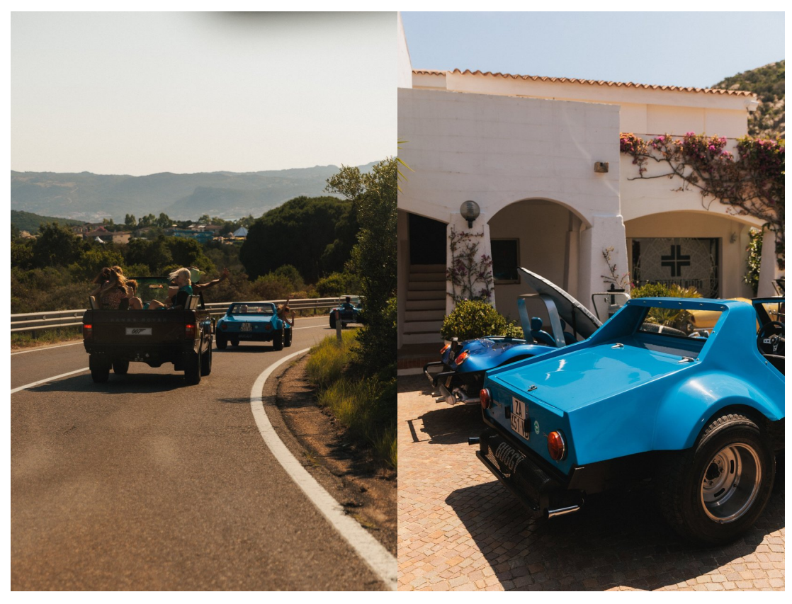
Of course, other automotive stars of Octopussy also made an appearance, including a rather special brown 3-door convertible Range Rover, featuring side-facing rear bench seats and large front bull bar, which those in-the-know will recognise as a Rapport Huntsman. Joining the perfectly beach-ready Range Rover in the 'Sex on the Beach' class were our friends from Meyers Manx, who had traveled all the way from St. Moritz with their glittering beach buggy, among many other spiaggine. Other beach cars we can't forget include the Autozodiaco Damaca — the Italian answer to the Meyers Manx — and the Gatto Dune Buggy, which looked right at home on Costa Smeralda's sandy shores.