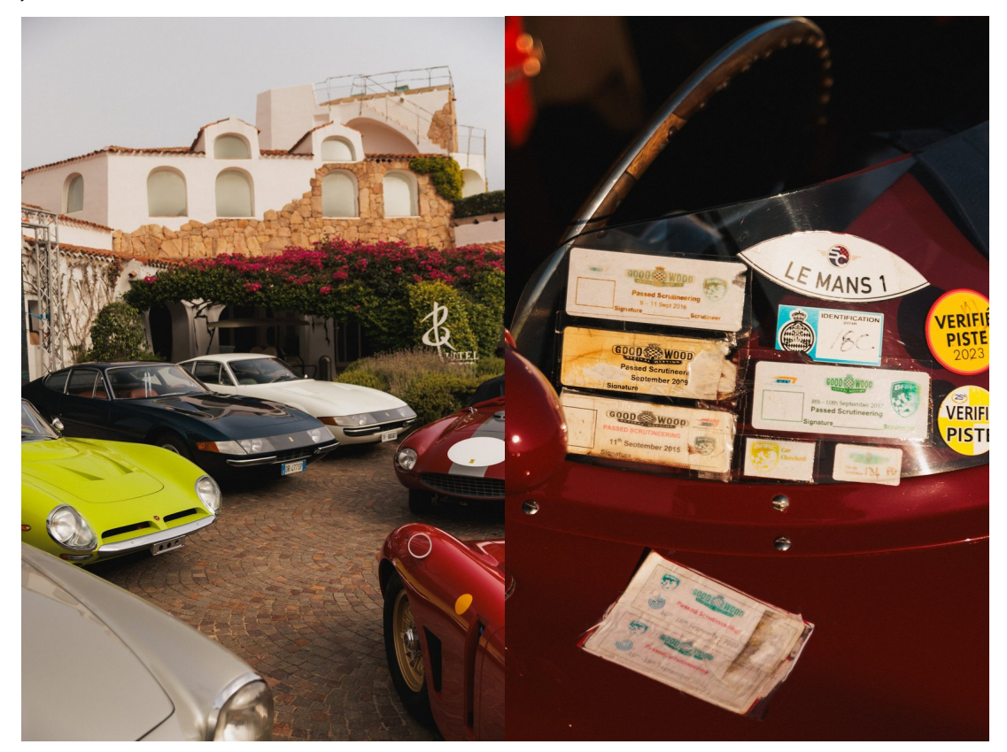
The most impressive supercars from Maranello stunned attendees in the 'Ferrari Tribute to Le Mans' class. Among them was the winner of 'Best of Show', a Ferrari 340 Mille Miglia owned by an Italian couple and accompanied by a library's worth of history across six separate books. While the owners of the 340 Mille Miglia were delighted to receive the award, their little Daschund was perhaps even more excited about the result.