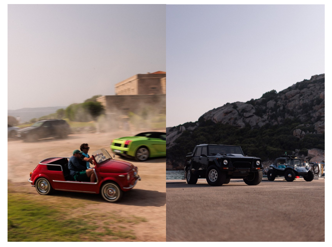
Topping off the list of eye-catching categories was the 'Something Special' class. Included in the mix of classic metal and modern carbon fibre was Kimera Automobili's radical EVO37 restomod and the fabulous black Lamborghini LM002 brought by our dear friends at Andreas Wüest. Speaking of friends, we were happy to see the guys from Morton Street Partners also in attendance, with whom we're releasing a very exciting story in the near future, so stay tuned!