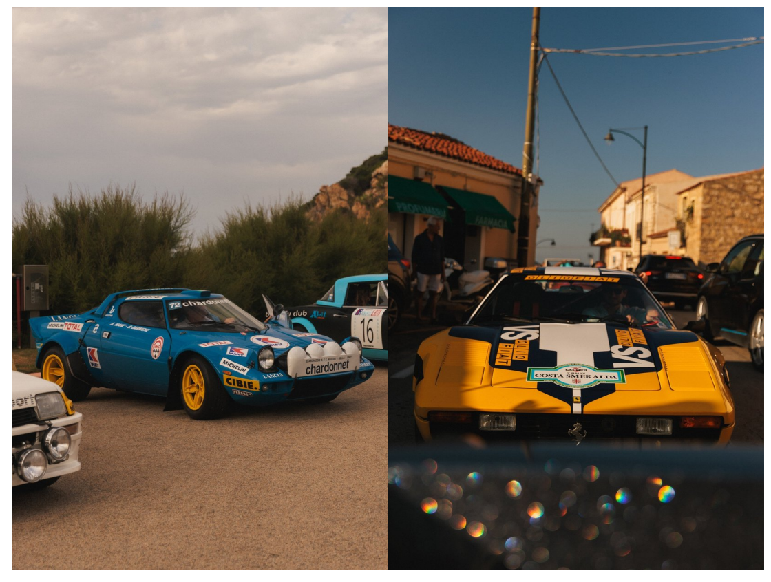
The 'Rally Queens' was another highly impressive class, spearheaded by Carlos Sainz' incredible Repsol Lancia Delta Integrale. The accompanying 1982 Renault 5 Turbo was also a sight to behold, but perhaps the most amazing aspect of this class was the gargantuan sound produced by the tiny Fiat Abarth 124 rally car.

Also definitely worth mentioning was the 'Peace and Love' category, which was home to a hilarious car collection — brought by a German attendee — that celebrated the most awkward French cars, including a Signal Yellow Matra 530 LX, which looks almost identical from the front as it does from the rear.