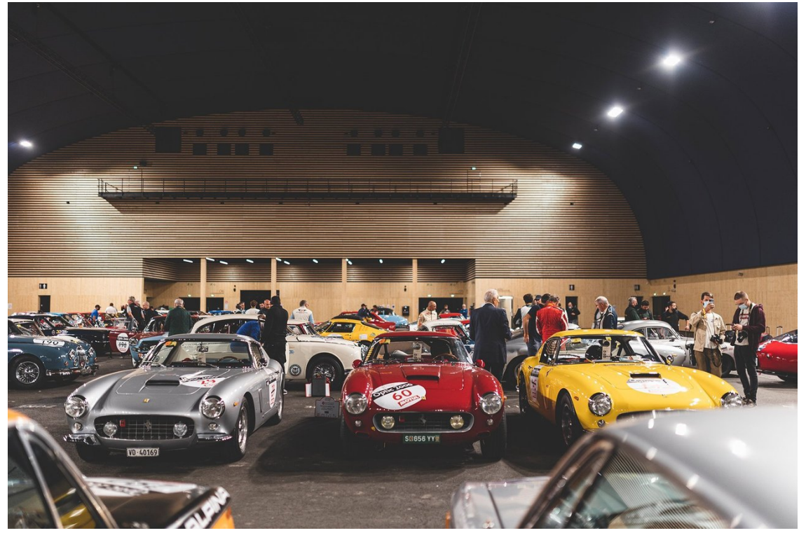
Tour Auto will also celebrate some 'Good Old English' cars that left their mark on the Tour de France Automobile in the 1950s. Drop-tops in the form of Jaguar's XK120,

Driving some of the best roads in Europe is one thing, but having the right car for the job is another. Thankfully, competitors bring out their finest machinery for the Tour Auto, with cars from the golden era of rally racing. If it was built between 1951 and 1973, expect to see it at Tour Auto, with everything from a BMW M1 Procar, Mini Cooper S, Shelby Cobra, right through to Jaguar E-Types, Alfa Romeo Guilia Sprints, and just about everything in between.