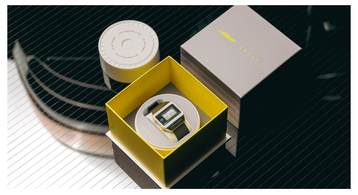
Available in four varying colour combinations, bare brushed stainless steel with contrasting yellow accents, a grey plated brushed stainless steel with green accents, a stealthy DLC black-plated brushed stainless steel with red and yellow accents, and finally a vibrant yellow cerakote with black and yellow accents, with each one carrying their own unique style and resemblance to race cars from this new-age era. Our personal favourite is the bare stainless-steel example, offering a rawness and charm to a watch that can be used every day if required, but also can look stylish due to its bright finish.