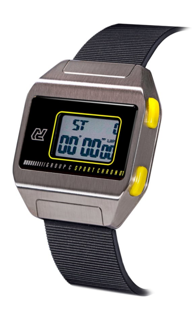
The display itself is made from a chamfered sapphire crystal that reveals a simple black and white LCD module, with blue EL backlight, long before the dreaded smartwatch ever existed, the coolest gadget for your wrist was a light-up watch! The Group C watch can time laps, as well as split times, and displays the time and date with micro precision, and has an alarm function. A reversible custom moulded FKM rubber strap holds it to your wrist, and 20mm lugs mean you can swap in any of Autodromo's stunning leather straps should you wish to smarten it up further.