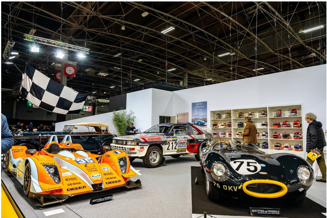
Of course, it's not just road racing cars that get the limelight at Rétromobile, those who tackled the toughest terrain and tightest of turns have also earned some fame, and French-born auction house Aguttes have brought the heat, or mud. Alongside a glorious Jaguar D-Type and Porsche 911 3.0 sits some of rallying's greatest weapons, including a Peugeot 205 T16 and a rarer-than-rare Audi Quattro in full Dakar rally specification. Plus, one of the best display of motorsport helmets we've ever seen!