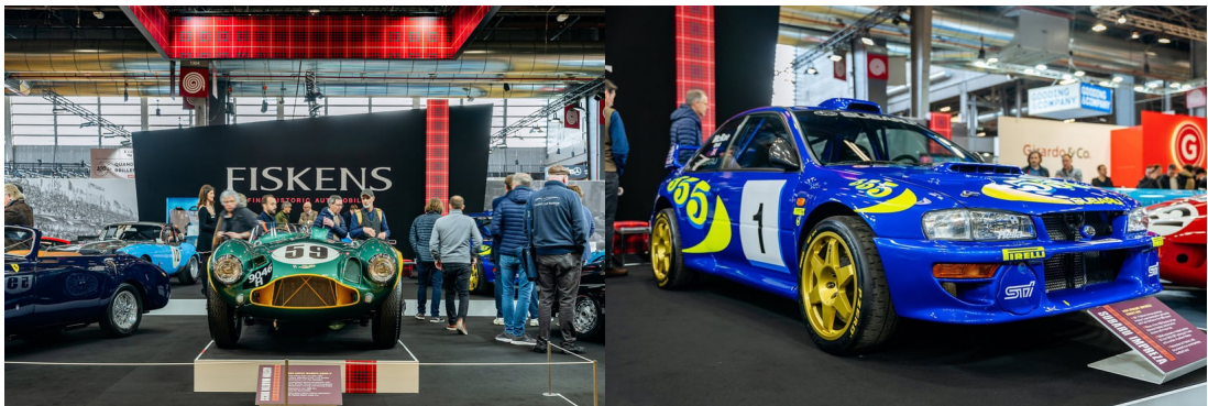
Meanwhile London-based dealer Fiskens turned their show stand into a motorsports hall of fame. The 14-car line-up included a star-studded Aston Martin DB3S, one of the founding Porsche 356 Carreras, a hugely successful Aston Martin DBR9 GT1, and quite literally everybody's favourite gulf-liveried Porsche 917K that had starred in the movie 'Le Mans' next to Steve McQueen!