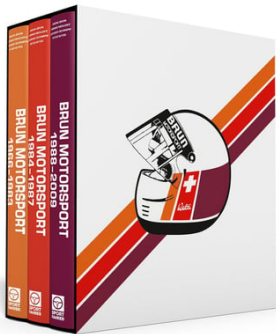
Edition Walter Brun

During the making of the book a staggering 1,200 photos from racetracks around the globe were collated, as well as imagery from the set-up of the cars, victory celebrations and private moments, showcasing the glamour but also the reality of life on the motoring circus. Sacha perfectly summarises what seeing these photographs evokes: "It is a unique team story, marked by a passion for motorsport that does not exist a second time and will never exist again."