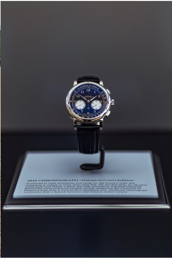
Aside from the cars, the event's biggest reveal came from our friends at A. Lange & Söhne, who unveiled their stunning one-off 1815 Chronograph "Hampton Court Edition". The stunning timepiece will be auctioned off on the 6th of November by Phillips in association with Bacs & Russo at the Geneva Watch Auction XVI with the proceeds being donated to the Prince's Trust.