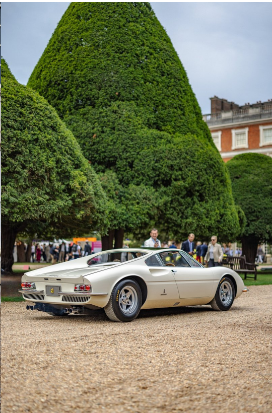
This year's event also celebrated 75 years of Ferrari, marked with a lineup of thoroughbred prancing horses in front of the palace. Among them was the aforementioned Ferrari 250 GTO, wearing its stunning patina that we remember so well from The ICE , the magnificent 365P Berlinetta 'tre posti', and our favourite, a jaw-dropping 750 Monza.