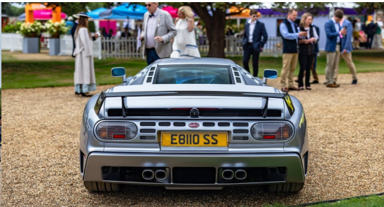
While we are unfortunately unable to mention every spectacular automobile present at the 2022 Concours of Elegance, we hope that we've given you a taste of the amazing display put on last weekend at Hampton Court Palace. Once again, the Concours of Elegance has proven itself as a definite highlight on the automotive calendar.