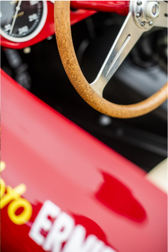
The most remarkable examples? We would have to name the Ferrari 250 LM, the 250 GT LWBZagato, the shark-nosed Ferrari 196SP Fantuzzi Spyder, the 340 America Vignale, and the 330 Pininfarina Speciale.