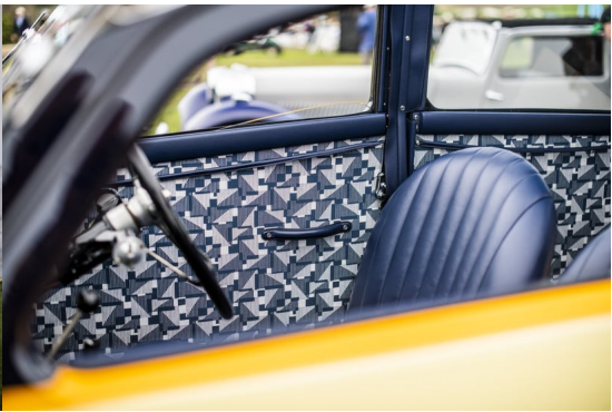
Besides the countless remarkable blue-chip collector cars competing for class and overall wins, this year's Pebble Beach Concours d'Elegance put the spotlight on the centennial of Lincoln, a brand rarely featured at concours events but highly interesting, the Talbot Lago Grand Sport and the Alfa Romeo 8C 2300. Another highlight of post-war Italian design and engineering was the special class of 'Otto Vu' Fiats and Siatas – an automotive species that is rightfully getting more and more attention.