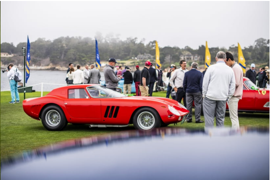
Speaking of Ferraris: The cars from Maranello are always well-represented at Pebble Beach, and this year was no exception. We already had spotted some of the Prancing Horses on Thursday during the Pebble Beach Tour d'Elegance – now seeing the mythical racers and grand tourers gather in front of the misty pacific was a sight to behold.