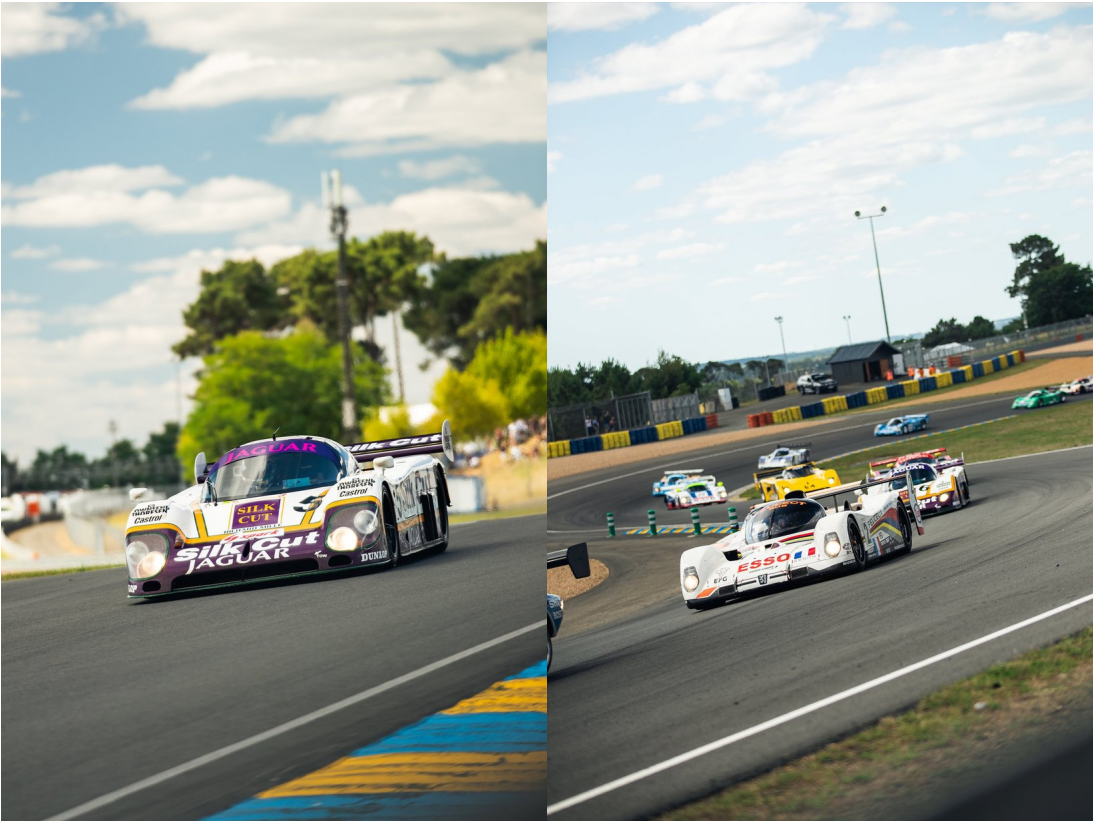
Perhaps just edging out the Dallara in terms of auditory euphoria was the sub-zero Peugeot 905B Evo, which looks just as futuristic today as it did back when it debuted in 1991. Among the other Group C monsters that caught our eye were a plethora of Silk-Cut Jaguars, and who could forget the rotary-powered orange and green flash that is the Renown-liveried Mazda 787B?