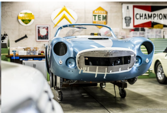
Another example we have is the 250 Berlinetta. The car has been here for a long time, but it was about finding the correct car to compare and identify differences, finding out what had happened to the car before we started the work, making sure we had every detail straight. We talked history, but every project has its own, it takes time and