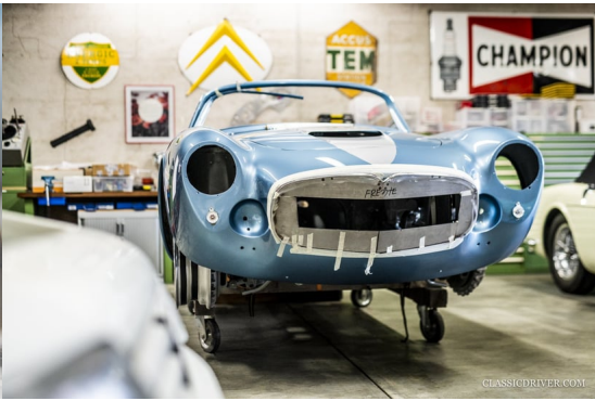
Another example we have is the 250 Berlinetta. The car has been here for a long time, but it was about finding the correct car to compare and identify differences, finding out what had happened to the car before we started the work, making sure we had every detail straight. We talked history, but every project has its own, it takes time and