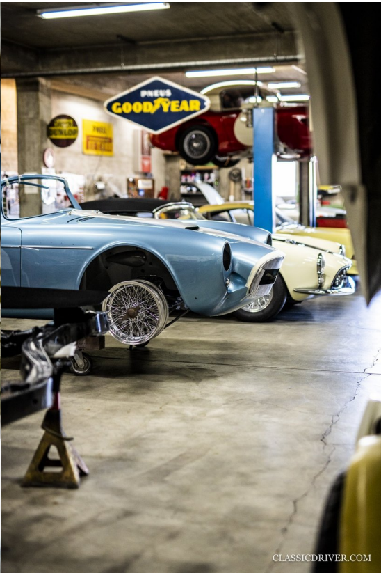
The dashboard is a good example, as are the door panels as nothing exists except the other example to use as reference. Everything has to be made, copied, adjusted, altered and so on. Days are long, but on the other hand, it's like restoring a fine art picture, the prospect of looking at it once finished keeps the project going.