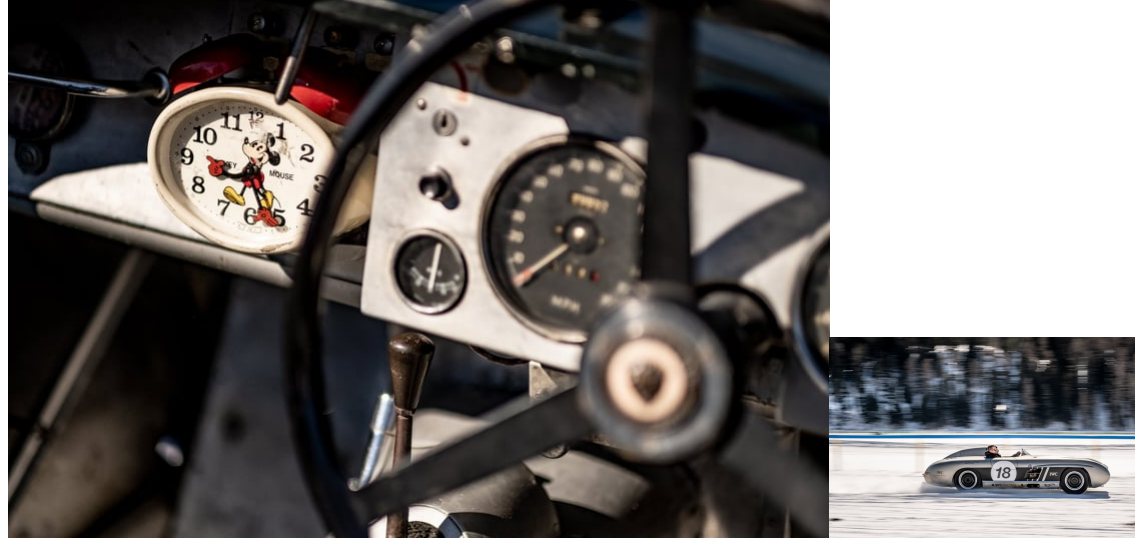
Above all, though, what wowed us the most was the 1956 XKSS completing near full-laps at a 45 degree angle with the event's undisputed and anonymous Drift King behind the wheel, within the set speed limit of course. Also frequently sideways was IWC Racing's 1956 Mercedes 300SL Porter Special, which looked like a UFO hovering above the ice as it emitted arguably the best engine note of the event.