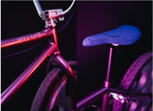
To celebrate the launch of the new issue, PMC have also launched a limited-edition capsule collection of clothing, that is available now in the Classic Driver Shop along with the unique BMX and the latest issue of the printed journal.