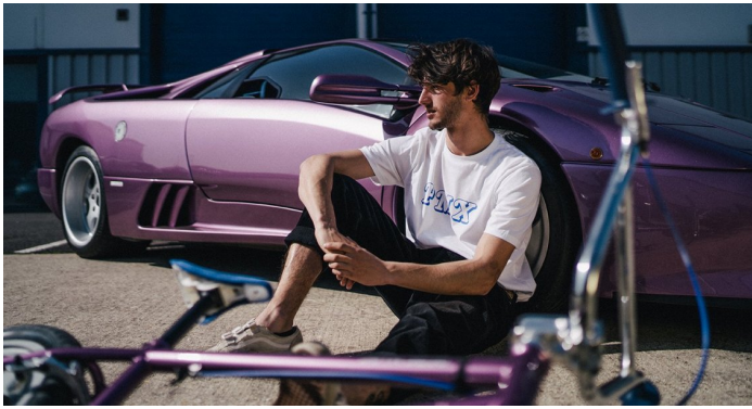
The interior of the Diablo is bathed in blue Alcantara and so the BMX seat was sent away to Twentieth Century Motorcars to get trimmed in matching Alcantara. Then the bike was built up using silver parts to make it rideable.