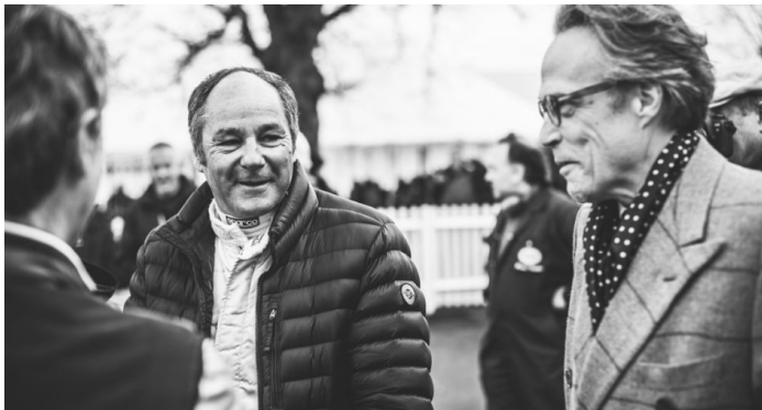
It was encouraging to see so many motorsport legends present at the Members' Meeting — Gerhard Berger clearly relished the chance to pilot a BMW 635CSi touring car in the Gerry Marshall Trophy.