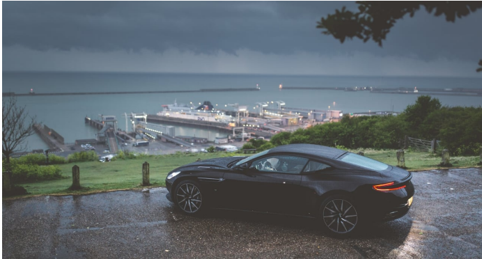
Our ‘Gentleman’s Journey’ from London to Paris , kindly supported by Hackett, was definitely one of our highlights of 2017.