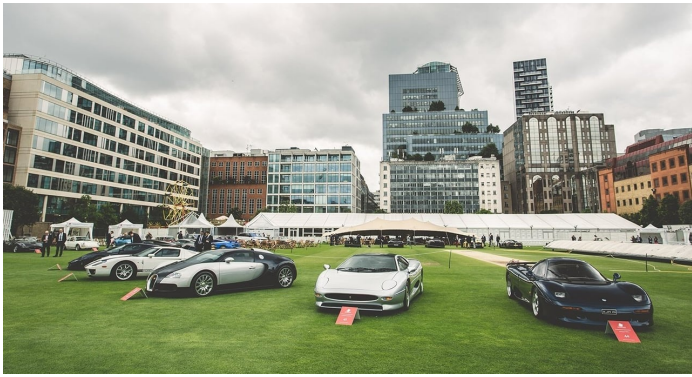
Held at the picturesque Honourable Artillery Company in the heart of London’s financial district, the inaugural City Concours took place this year, and we were among the first through the gates.