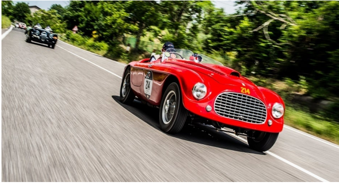
The Mille Miglia does more than unite classic car collectors and enthusiasts — it brings together communities, as villages and cities along the route turn out to cheer on the competitors.