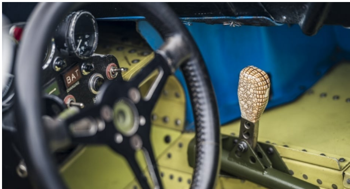
As is always the case at any of Goodwood's events, the devil is in the details...