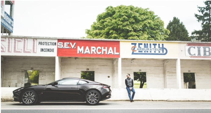
A visit to the Champagne region of France would not have be complete without a stop at the history-steeped abandoned Circuit de Reims-Gueux .