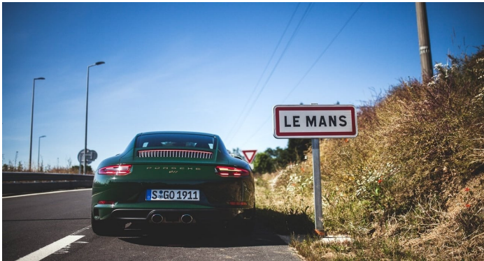
There are a million ways to travel to Le Mans, but perhaps none as special as in the one millionth Porsche 911. We embarked on an unforgettable pilgrimage .