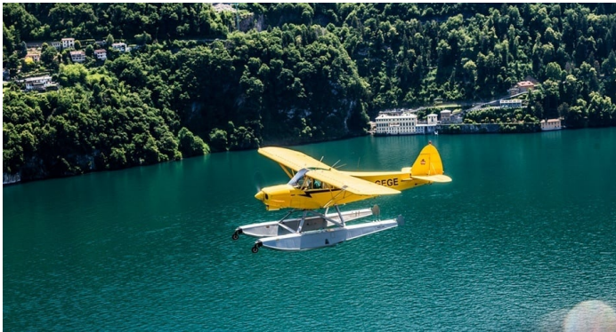
Forget a Lamborghini Miura, a classic Moto Guzzi, or a gleaming Riva Aquarama — the only way to arrive at the Concorso d'Eleganza Villa d'Este is by vintage seaplane ...