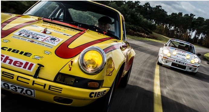
This phenomenal pair of Porsches , both veterans of the original Tour de France Automobile, was the perfect way to get in the mood for the 2017 Tour Auto.