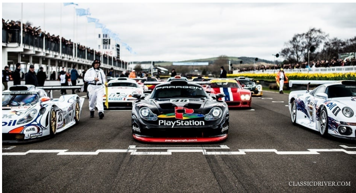
One of the many highlights of this year's Goodwood Members' Meeting was the high-speed demonstration of the monstrous GT1 endurance sports cars from the 1990s...