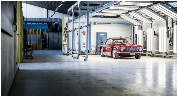
We went behind the scenes at Touring Superleggera to find out what goes into a Villa d'Este award-winning restoration...