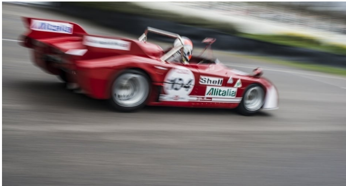
Saying that, the screaming 3.0-litre sports prototypes from the early 1970s were hardly disappointing...