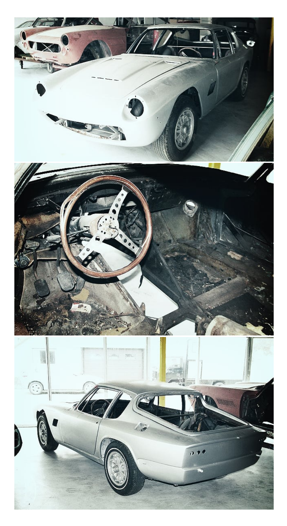
This time it's just a bodyshell and two axles: no other parts at all. But we're told the metalwork is in good condition so, if you know someone with a rusted Mistral that desperately needs a replacement body, hey presto!