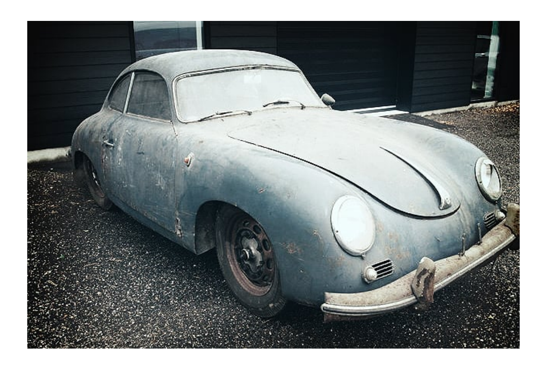
This 1952 <u>Porsche 356</u> coupé has been in storage for 44 years but, importantly, it's said to be a 'matching numbers' car with a fully documented history, including servicing bills.

Buy this Porsche 356 in the Classic Driver Marketplace >>