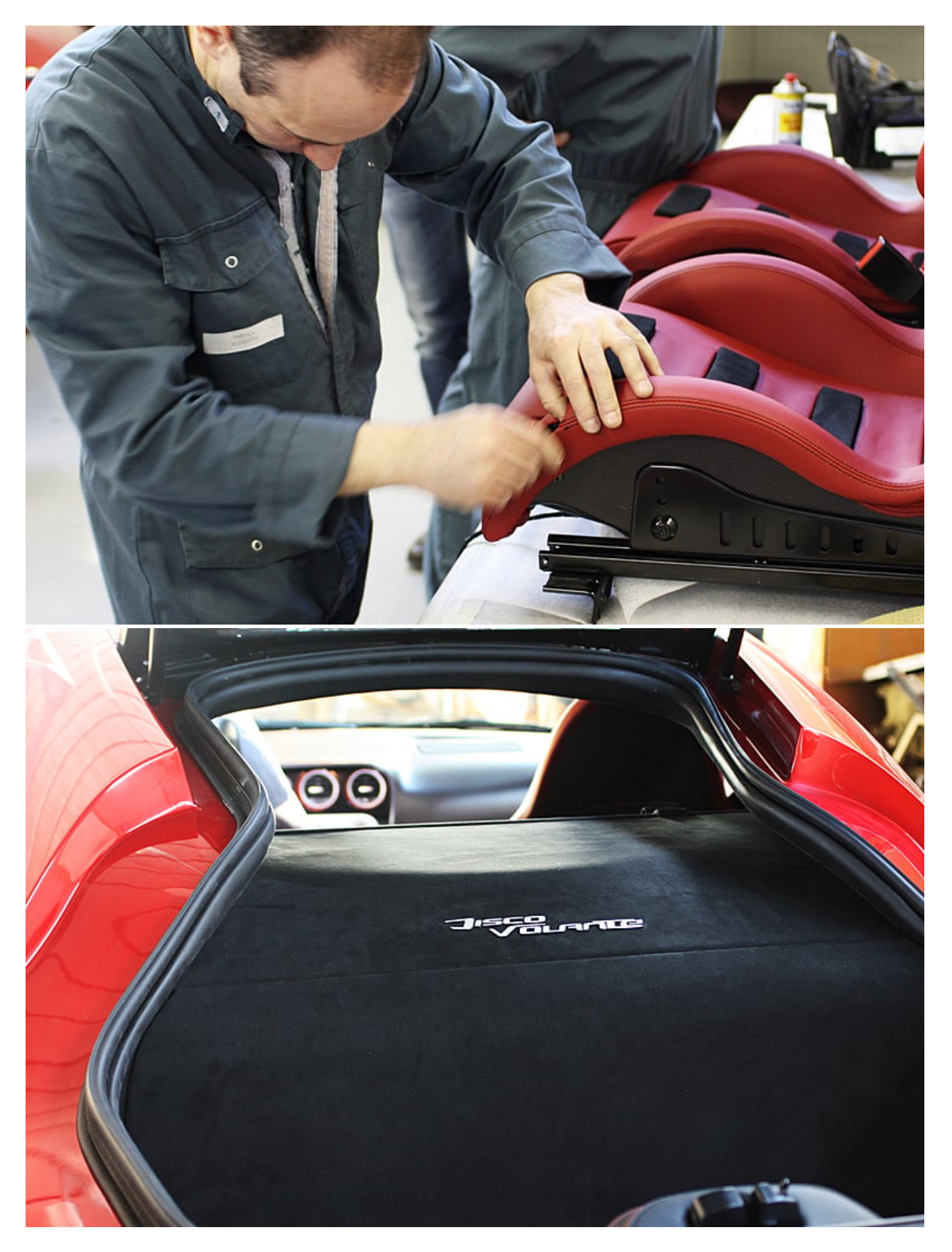
The interior, although incorporating the basic architecture of the Alfa Romeo 8C, is heavily reworked to give more of a 'space age', or 'science fiction' feel that befits the name Disco Volante ('Flying Saucer' in Italian). Red LED interior lighting matches this mood, and the special exterior colour is mirrored inside the cabin, with hides specially dyed to match.