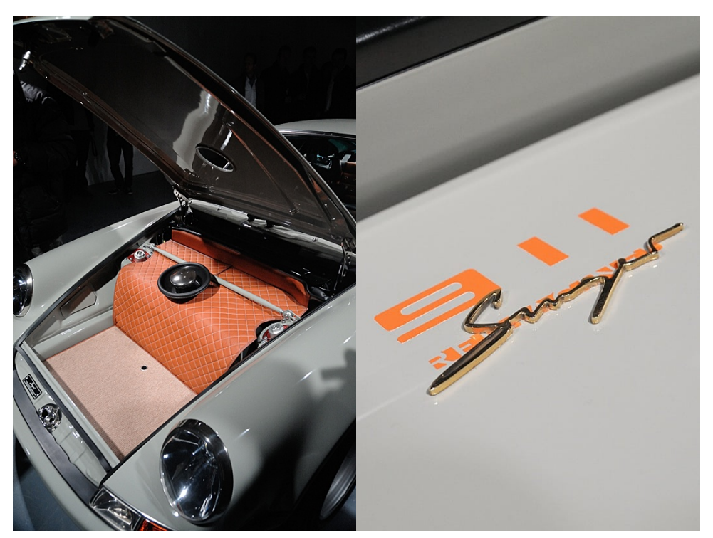
It is an incredible machine. And one few have driven - although with performance similar to a modern GT3 RS (380bhp in a 1,200kg package, modern race-tuned suspension and brakes), it promises to match dynamically on the road or track what it offers visually as a static 'work of art'.