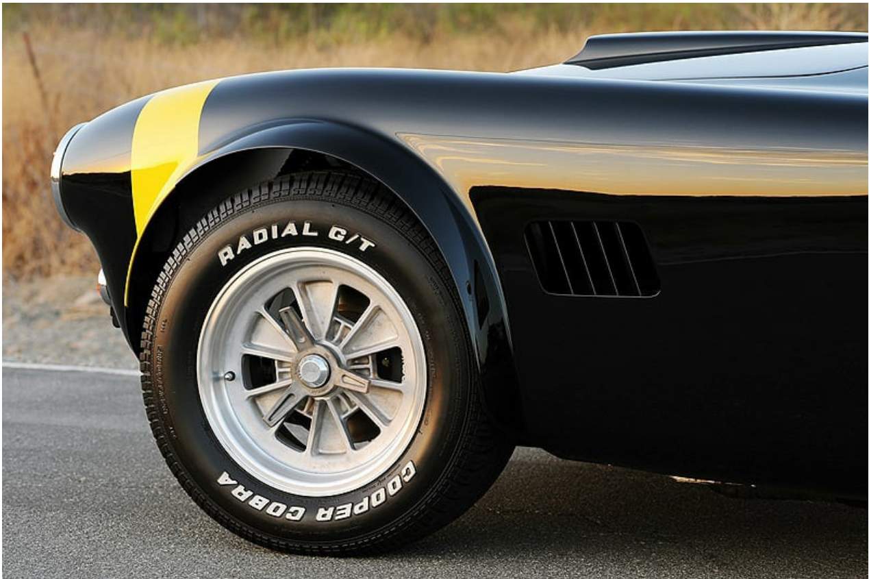
This version has a glassfibre bodyshell faithful to the lines of the 'FIA' Shelby Cobra racing cars and comes complete with a Ford Racing Boss 302, 'Stroker 347' V8.