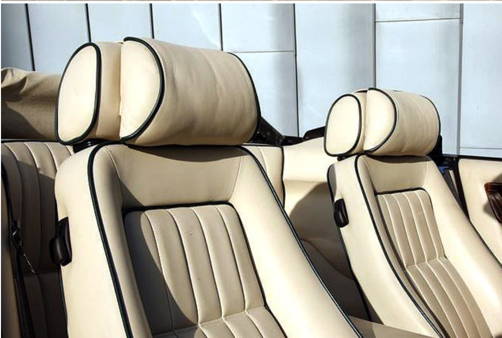
The “first truly new Aston Martin in nearly 20 years” (Aston’s own words), the Virage was unveiled at the 1988 Birmingham Motor Show. Using a redeveloped version of the robust 5.3-litre V8 engine, the new car