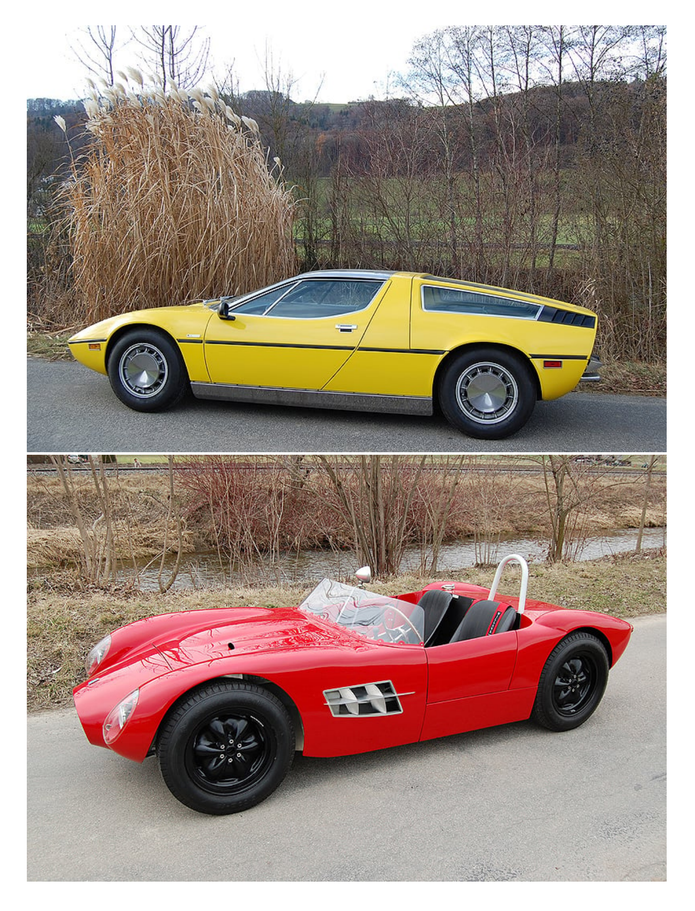
Switzerland is not always known for its car industry; however, the manufacturer Monteverdi is an honourable exception. The unusual Monteverdi Hai MBM SP-100 OSCA from the 1960s has been in the same ownership since 1978. 'On Request' for price, please.