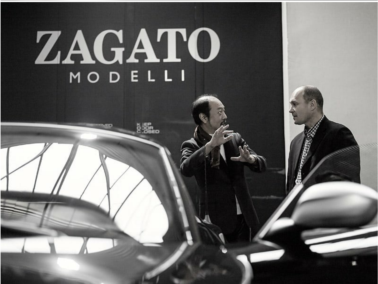
Reprising a design feature seen on the Aston Martin V12 Zagato – itself launched at Ville d’Este in 2011 – the mesh grille is composed of many small matt Zagato ‘z’ letters.