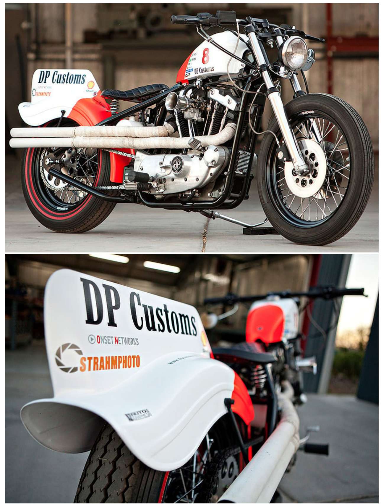
So, what's next for DP Customs? The brothers are keeping tight-lipped, but have promised to keep Classic Driver and our readers informed. Perhaps it'll be our suggestion, a Café Racer in red and gold livery as a tribute to the late, great Alan Mann? We're sure we'll be able to provide some Classic Driver decals for it.