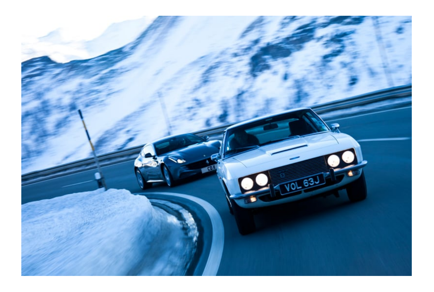
'Ferguson Formula': 'FF'. Neat, don't you think?

At the BP station on the outskirts of St Moritz we meet up with a very different 'FF': Ferrari's quite brilliant 'Ferrari Four', meaning four seats with four-wheel drive.