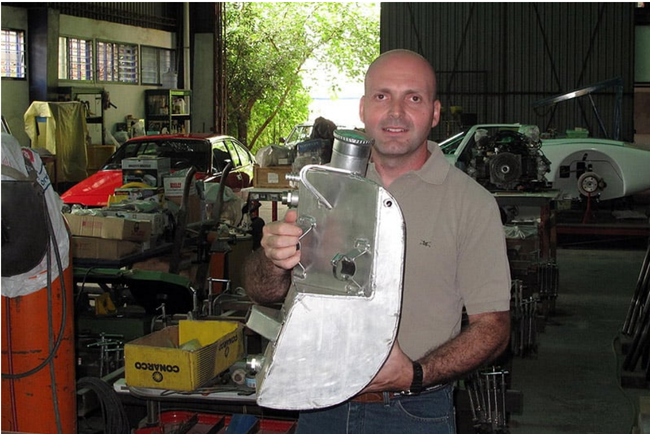
Text: Tony Dron

ClassicInside - The Classic Driver Newsletter Free Subscription! Gallery