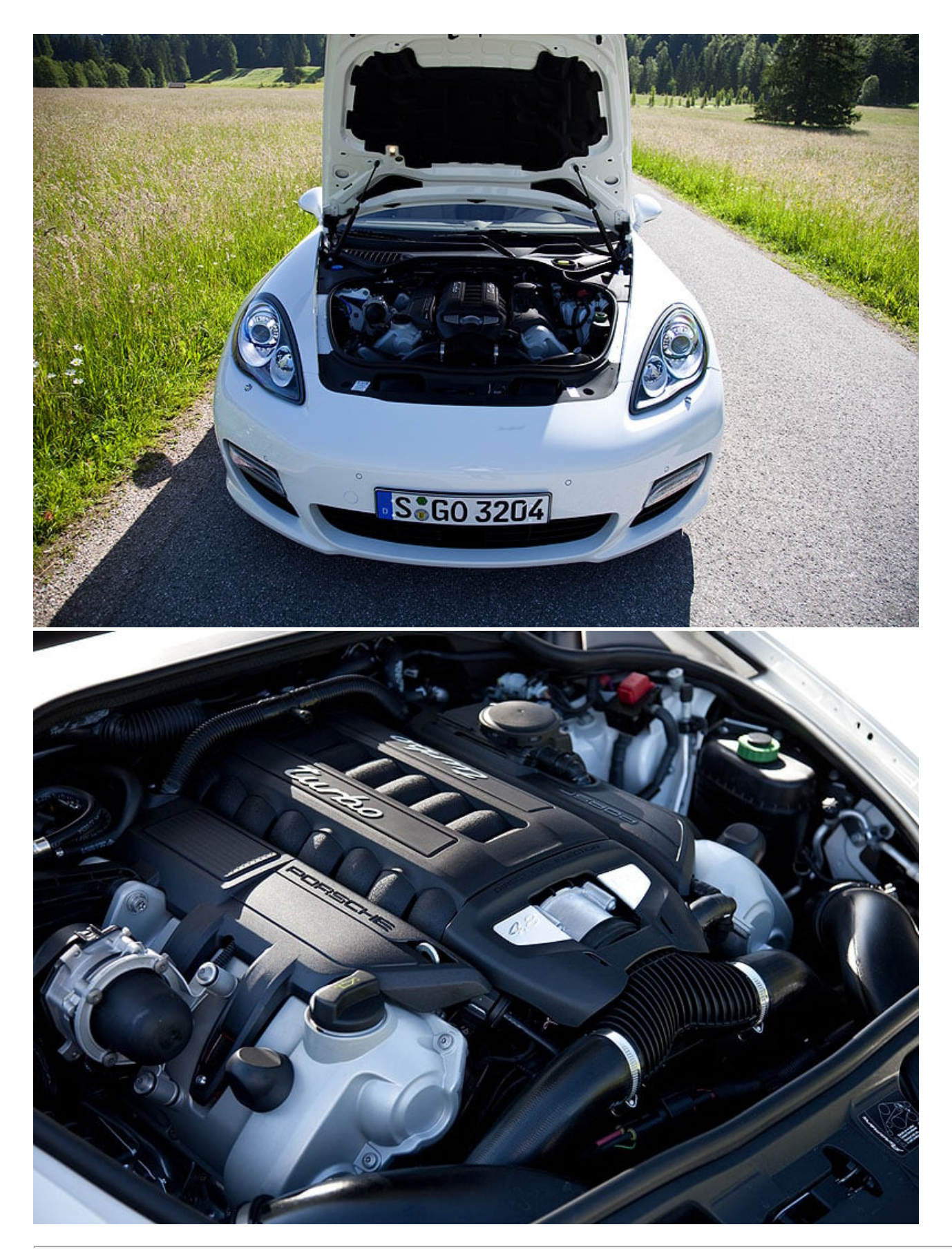
ClassicInside - The Classic Driver Newsletter <u>Free Subscription!</u> Gallery