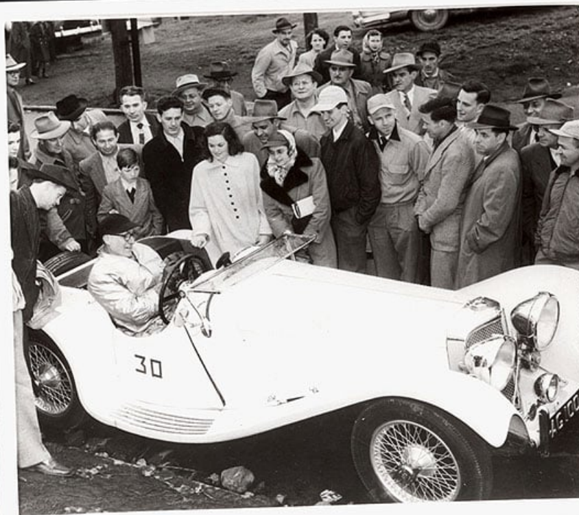
(HZ-2) Wilkes-Barre, Pa., May 10--TV Star Popular--Dave Garroway of television and radio fame, was swarmed by autograph seekers and well wishers today as he awaited the start of the National Hill Climb on Despair Mountain near here. Garroway drove a 1939 Jaguar SS-120.