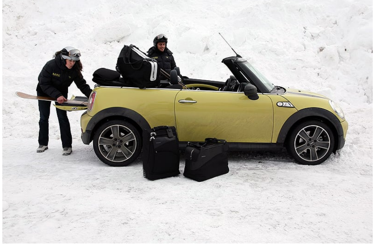
ClassicInside - The Classic Driver Newsletter Free Subscription! Gallery