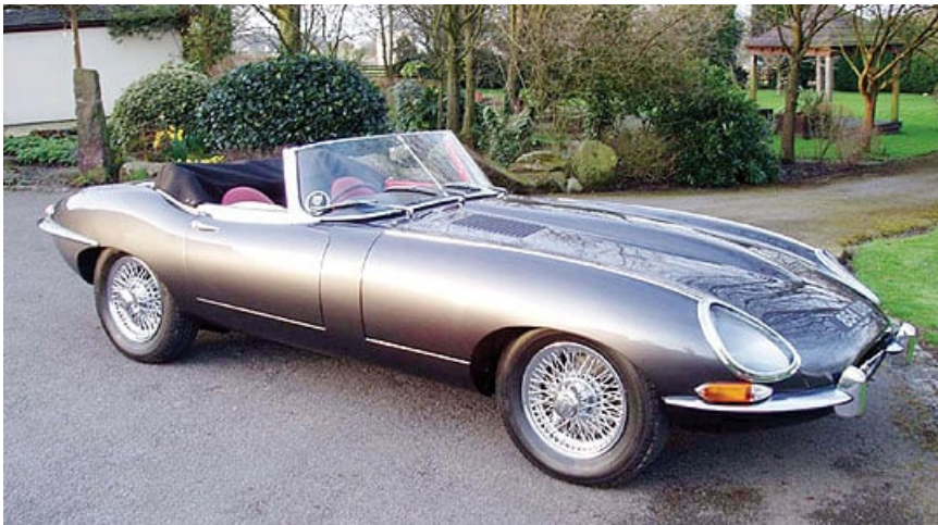
1961 Jaguar E-Type 3.8 'Flat-floor' Roadster - Sold for £50,525

H&H's next Sale will be at the Pavilion Gardens - Buxton, Derbyshire venue on 12 - 13 September 2006.