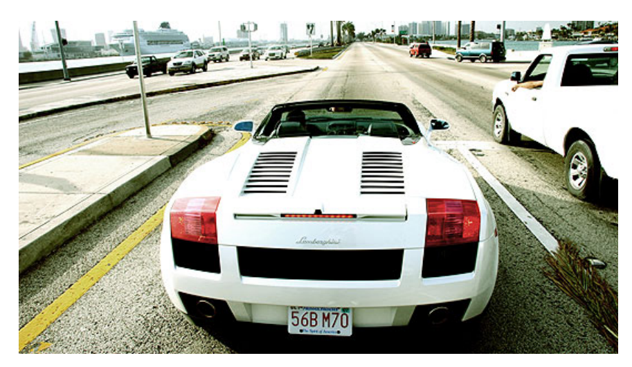
The Lamborghini Gallardo Spyder was introduced last autumn at the IAA in Frankfurt as the fourth model in

It's a simple formula - a short stab on the pedal means blasting acceleration, roaring exhaust note and blurred Art Deco frontage. If I ever had a reserved nature and upbringing it's all gone - I now feel strangely animal. The sun burns my face and arms white from a North European winter, behind my black sunglasses my eyes widen - the car is like having a tiger shark in the bath with you, it fun to play with but it might bite your toes off. I can see my car's profile reflected in the windows of the passing shops, and a passing Hummer H2 has its bass set low - it's time for me to take the ride.