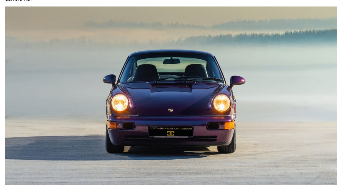
Only 2,276 units of the Porsche 911 Carrera RS were ever built, which makes finding a well care-for example in an interesting colour a particularly lengthy and challenging undertaking. Luckily, you don't have to spend the whole year searching, because we've found a car that ticks all the boxes: check out this gorgeous 1992 Carrera RS!

Lead We have no doubt that 2025 will be choc-full of incredible cars, but we'd happily spend the rest of the year admiring this gorgeous Amethyst 964-generation Porsche 911 Carrera RS.