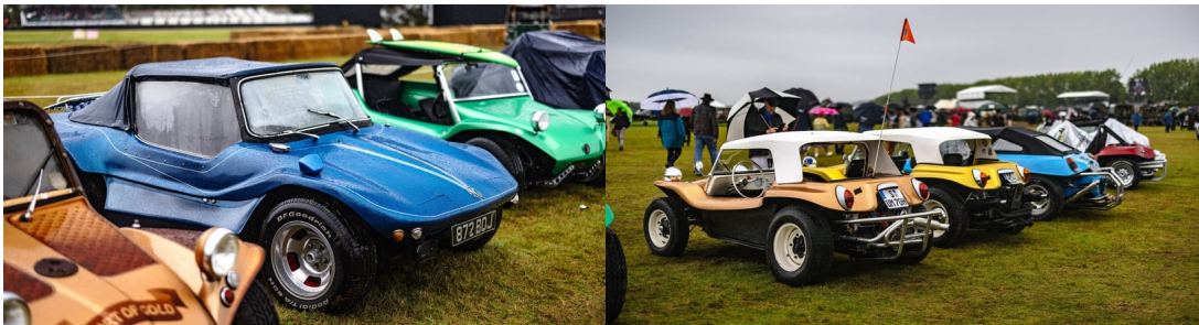
Guarding the gates to Manx-ville was a stunning yellow 1966 Volkswagen Baja Buggy, complete with a roof snorkel and meaty off-road tyres. Another favourite of ours had to be the Volkswagen Invader Buggy — a surprisingly convincing Corvette Stingray-lookalike — and while attempting to escape from the rain in the Earl's Court Motor Show, we got up close with the next generation of electric buggies: the Manx 2.0. It's clear that in 2024, the concept behind Bruce Meyer's original beach buggy is more captivating than ever!