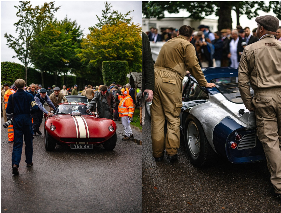
Also competing in the TT Celebration was a stunning part-painted, part-bare metal 1962 Torero Ecurie Ecosse-Ford, while the ever-lovable 1963 Chevrolet Cheetah joined in the sprint round the track. One of just 23 ever made, the ultra rare racer was driven to the track by its owner, who unfortunately lost control into the barrier during a particularly heavy downpour, thankfully escaping unscathed.