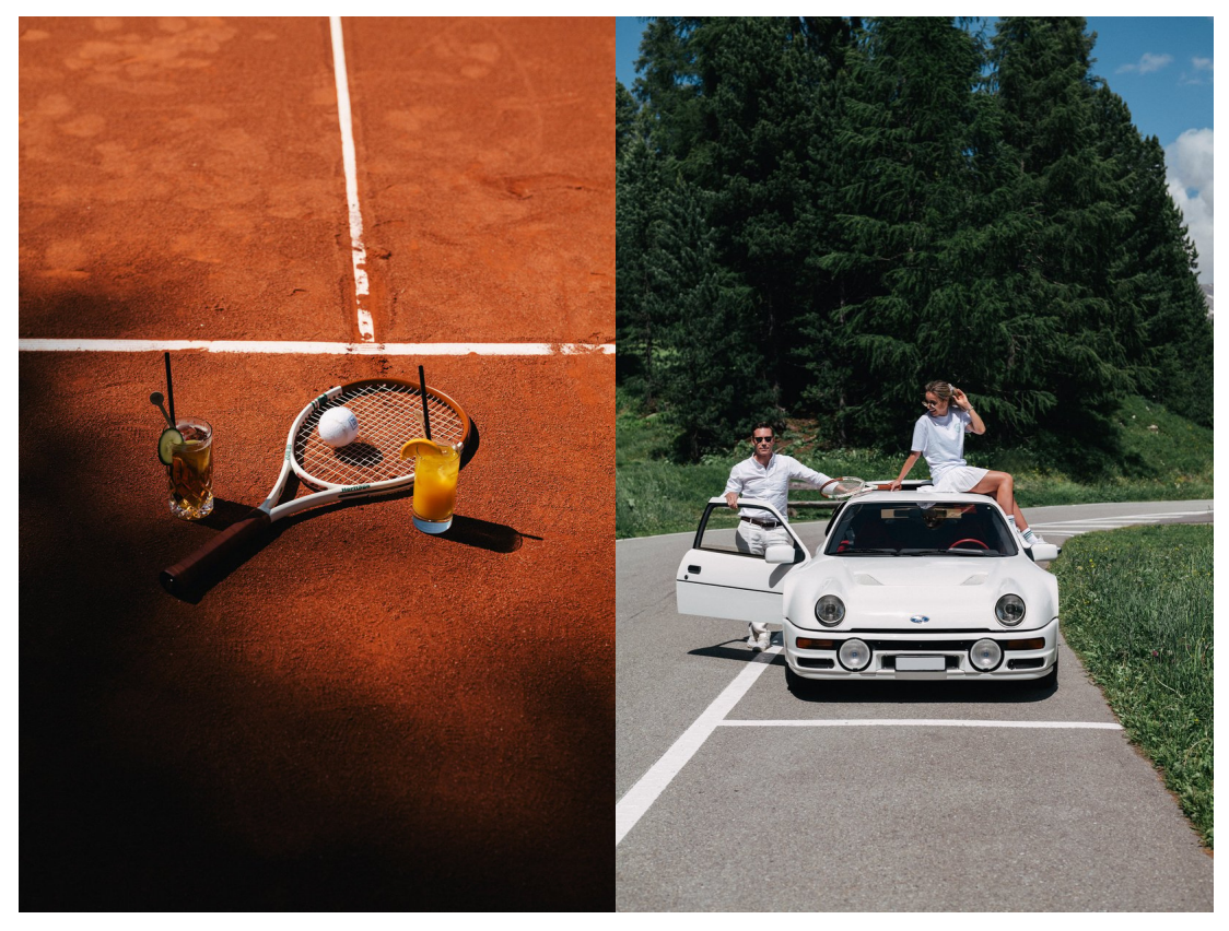
Clay. Grass. Tarmac. However you play your tennis, or drive your car, the region is bursting with opportunities. Starting the journey at Badrutt's Palace, nestled deep in the heart of St. Moritz and offering al fresco adventures in the sun-soaked Engadin Valley, it's the ideal place to start the tour, especially in two seemingly tennis-themed cars, the white Ford RS2000 and Porsche 911 2.7 RS. From there the club heads to Suvretta House for some world-famous aperitivos and maybe a Club sandwich, before heading out onto their immaculately prepared clay court. Finally, heading to St Moritz's true home of racquet sports: the tennis club of St Moritz.