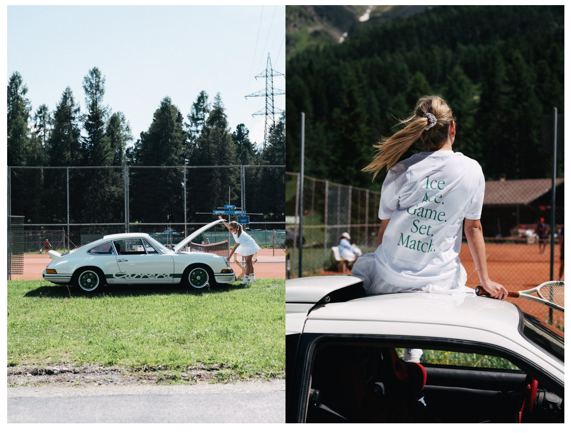
It's an event that <u>dazzles the snow-capped ski resorts and sold-out hotels every single year without fail</u>, and even when the weather doesn't play ball, The ICE has proved itself to be far more than just an annual car event, but instead a community of like-minded individuals who love Switzerland's breath-taking region just as much as the priceless cars they bring. While preparations are well underway for 2025's snow-covered soirée, the team knows a thing or two about summers in St Moritz too, and there's no better place to settle a friendly dispute than on the tennis court.