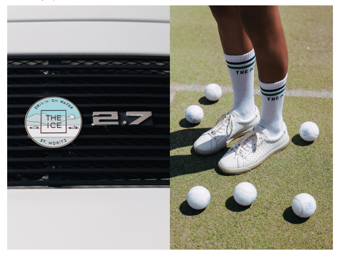
Of course, this is one of the world's most beautiful vistas, with towering mountain ranges, undulating roads, and world-class hotels and leisure activities aplenty, making it the ideal place for a summer get together with friends. The ICE wanted to showcase this in its entirety, bringing together a community of car and sports fans.