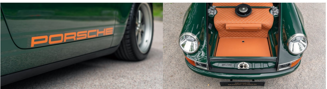
Its howling 3.9-litre flat-six was given new Cosworth-designed cylinder heads during its reimagination, as well as a fresh six-speed gearbox and limited-slip differential, bringing the total horsepower up to 380, truly a world away from the original 964 Carrera's 247bhp. Waiting lists for the Singer are still almost as long as the car itself, but thanks to Mécaniques Modernes & Classiques, this is your chance to skip the lengthy queues!