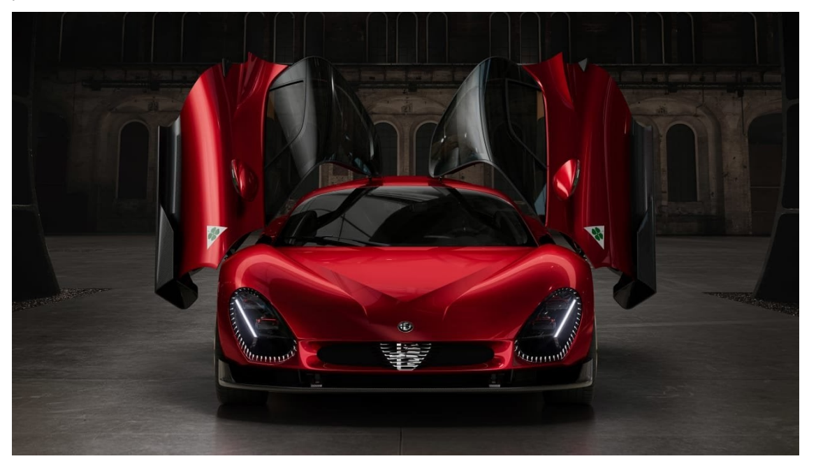
Built by the famed Carrozzeria Touring Superleggera, could this be the best looking release of the year?