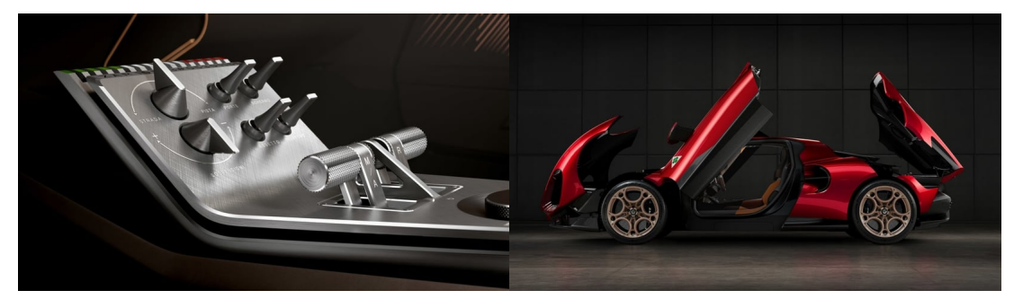
The 33 Stradale will be available with either a 750hp AWD electric powertrain or a 607hp twin turbo 3.0-litre V6 driving the rear wheels alone. However, you'd have to be out of your mind to choose the former.