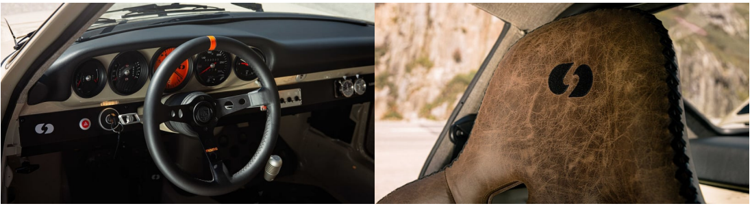
Of course, the engine is just a part of this highly tantalising recipe, and Sportec have graced the SUB1000 with Carbon Kevlar in spades. The lightweight composite is used in the doors, bumpers, bonnet, trunk lid, and fenders, while the rear side windows have been replaced with Makrolon, an extremely light and tough polycarbonate. The end result? A ready to drive weight of just 990kgs, making this one of the lightest 911s on the planet.