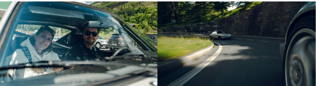
It is also worth mentioning that the exact roads are not revealed until the very last moment, to keep suspense up. There is also an added bonus in meticulous curation of the culinary experiences. Both Kerstin and Mo are big time foodies and want their guests to experience the most authentic and inspiring cooking any region Sickalps passes though has to offer.