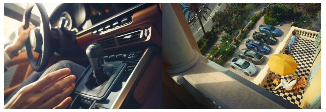
Finally, the design. Finished in exclusive Sports Grey Metallic with painted double stripes and riding on reinterpreted Fuchs-style diamond-cut wheels, the similarities between this and the 997-gen Sport Classic are immediately evident. Another exclusive design highlight is that double-dome roof, while it would be remiss not to mention the stunning houndstooth and two-tone Black and Classic Cognac leather interior. Overall, we think this new 911 Sport Classics is a seriously tasty package, and at 272,714 euros it certainly should be.