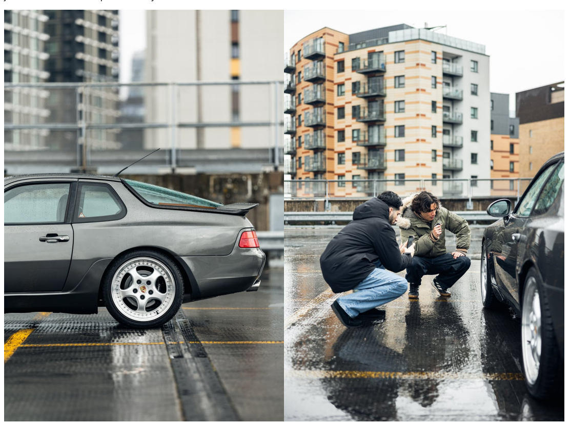
The collector car world can be a bit uptight and serious sometimes, but your approach is refreshingly casual and comedic. How are you putting a new spin on the age-old art of automotive journalism?

I think the Venn diagram of cars and fashion has a huge overlap. Having a good spec is like knowing the colours on your outfit, and they follow the same rules. Blue cars with a tan interior will always work, just like with clothing. I also think the attention to quality is also a huge parallel, which is why I like vintage cars: you get patterns and materials you would never see on a modern car. I would buy an ancient Cadillac Eldorado just for those crazy velour interiors. Present day, very few get this right, but Porsche do a good job — the houndstooth patterns they offer are so cool.