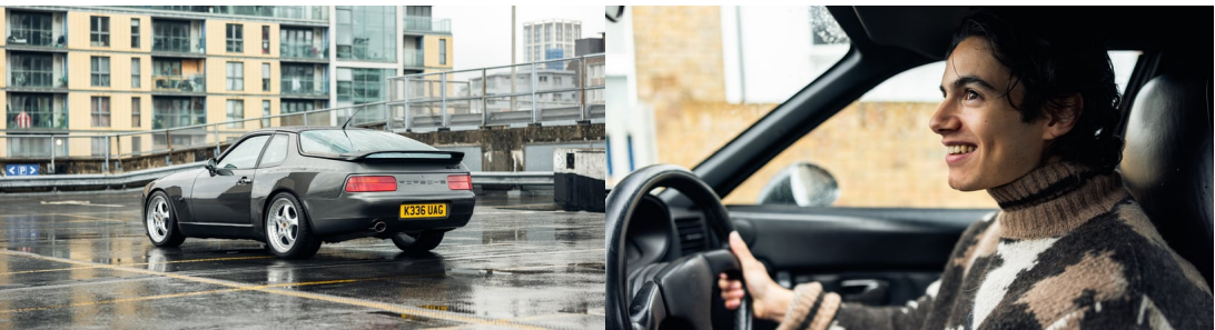
The rest of your collection is pretty eclectic too, as anyone who follows your instagram account will know. Could you run us through your garage, are there any favourites?

My Mk 1 MX-5 was the first modern classic I bought, and that has a very special place in my heart. I'm about to hand over the price I paid for it to restore it. My Volvo P1800 ES comes in a close second; I always wanted a proper classic and something I could imitate a 1970s rockstar or geography teacher in.