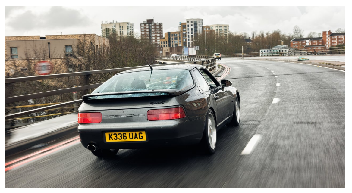
Let's talk about your personal collection, starting with our star car today: your amazing 968 Sport. The 968 is one of the most underrated models in Porsche's back catalogue, what drew you to this example?

As I was scrolling through the classifieds two years ago, I saw it come up and I thought, in that colour and with those wheels, it should be double the price — only 13,000 were made, so it's one of the lowest production mainstream Porsche models, and the Sport is even rarer with only 306 built. I thought the idea of a 3-litre 4 cylinder was also pretty interesting, and that 3/4 profile is just spectacular, especially from the back. Anyway, I saw it had sold, but it was re-listed a couple days later and I knew I had to have it. Mine has the Techart front splitter — they're quite hard to come by, which is super annoying because it scrapes on everything. It has the Porsche Speedline wheels, which are also quite rare. Second hand, the real ones go for like 8 grand, but mine are just knockoffs.